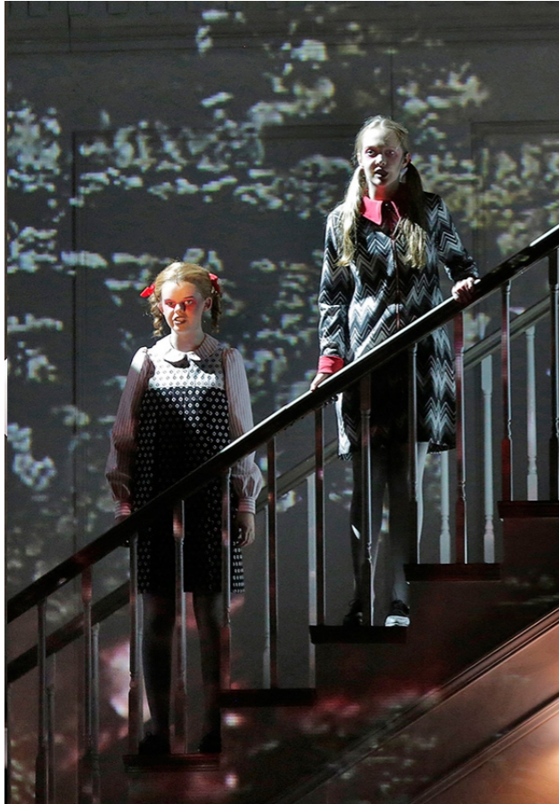
The twins scenes in the opera and the movie.