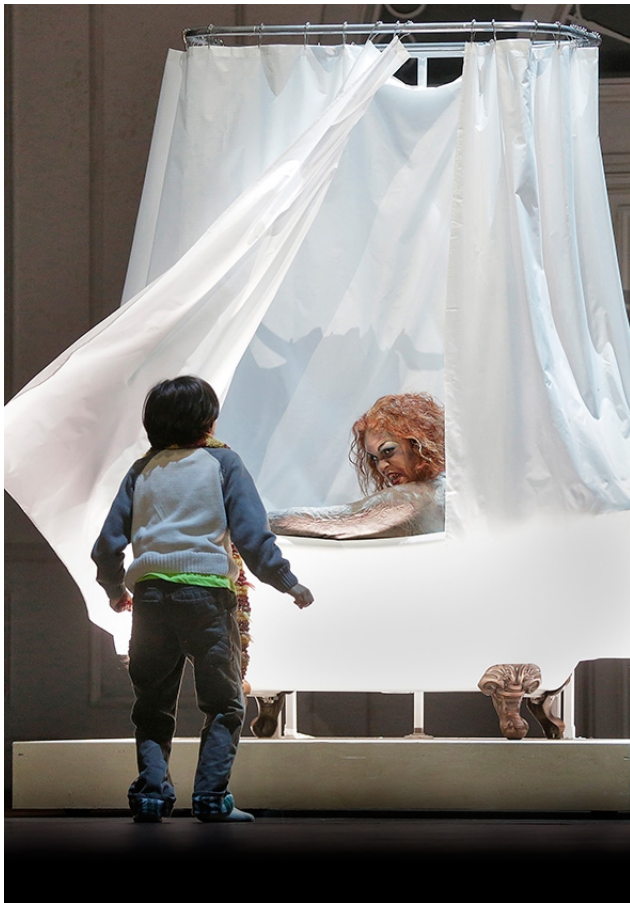
The bathtub scenes in opera and movie.