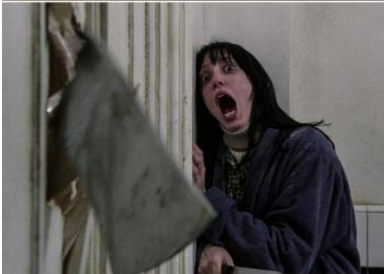
The movie's famous ax scene, below, as translated by the opera.