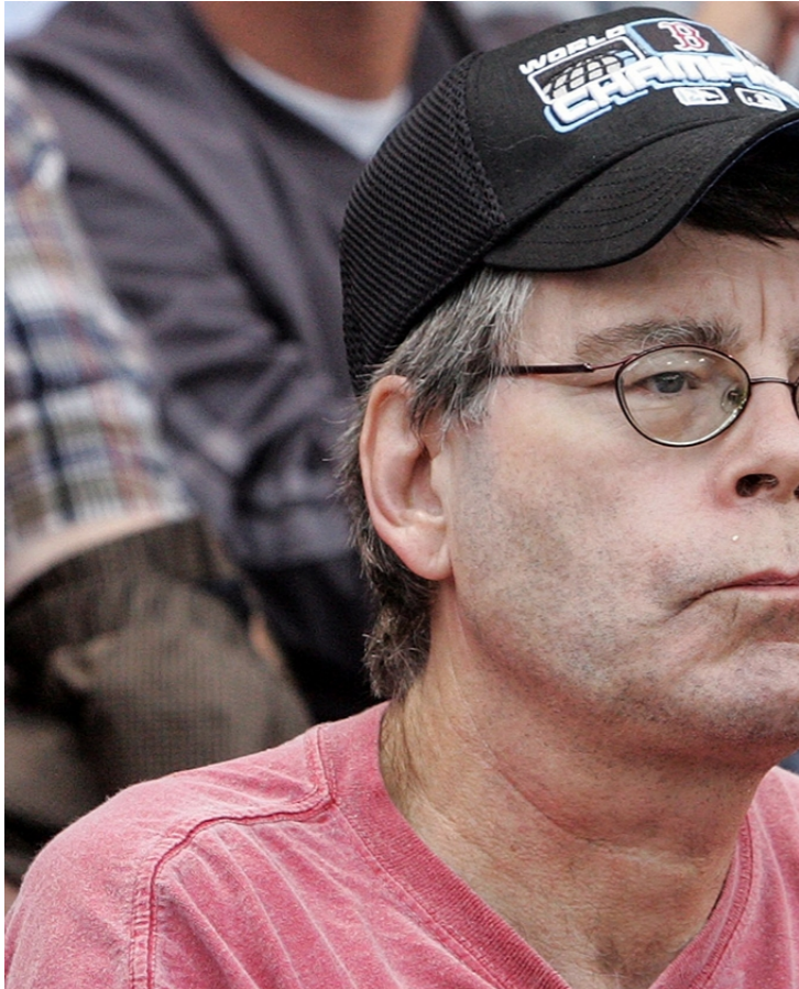
Stephen King at a baseball game between the Boston Red Sox and New York Mets on June 28, 2006, at Fenway Park in Boston.